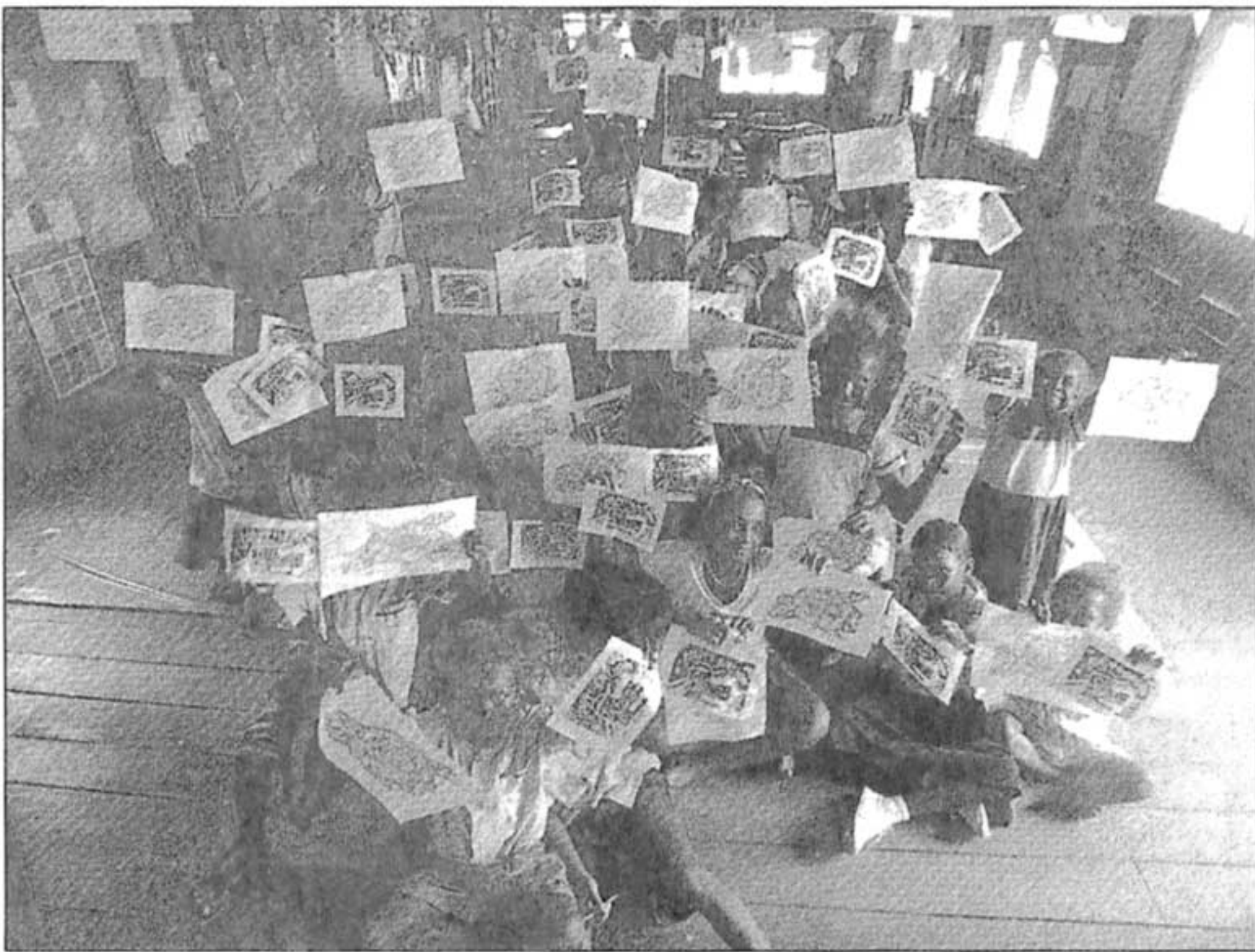
Participating students with woodcutprint.