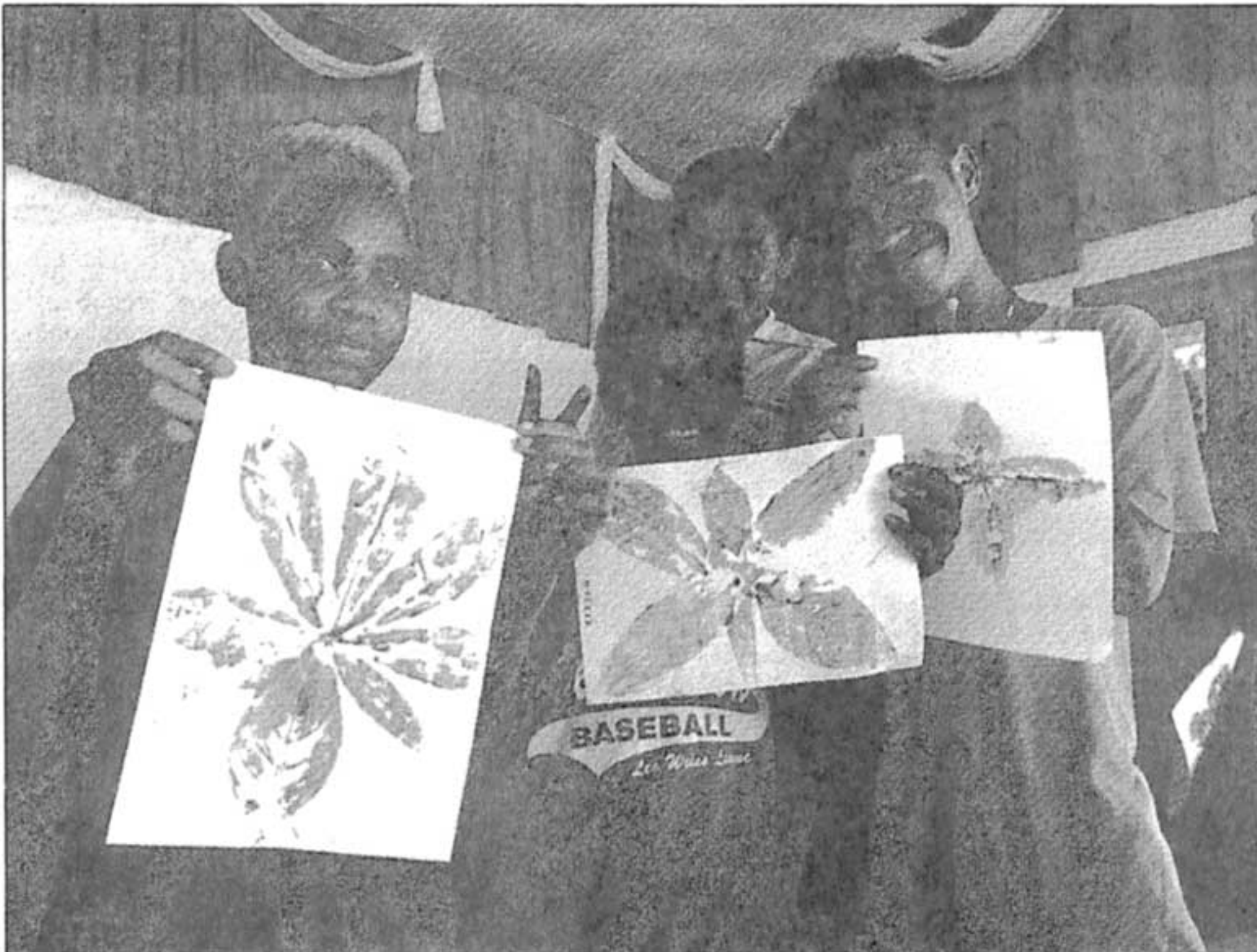
Students showcasing leafprint.